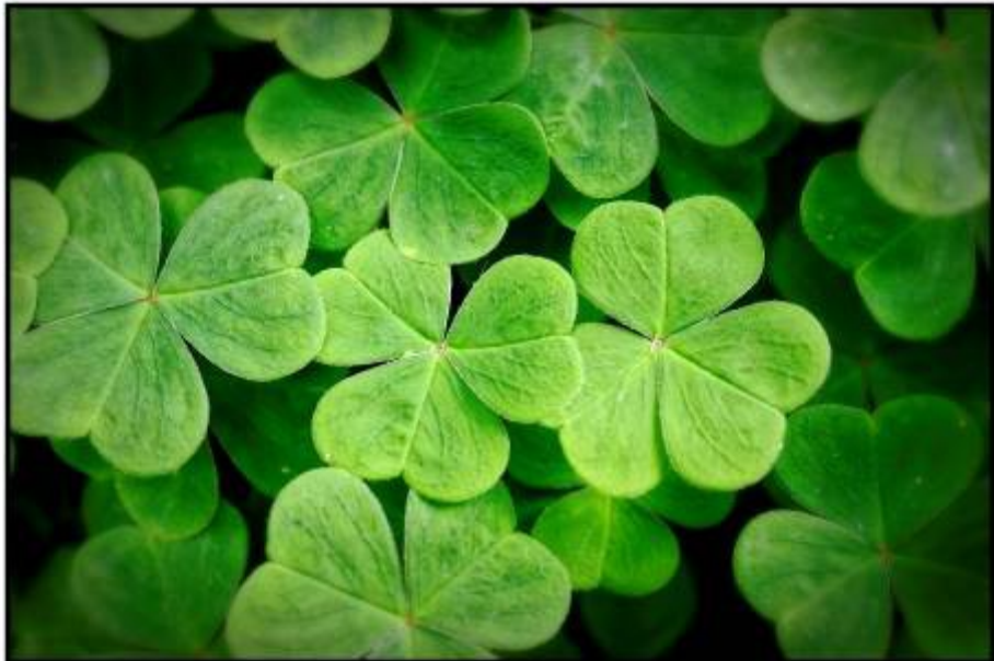
Bloedel Raging Green