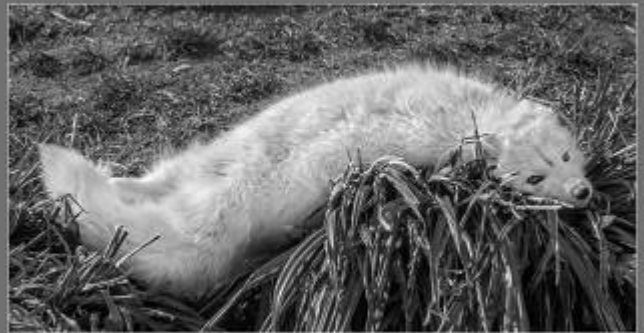
Arctic Fox Lollygagging

Print Makers; remember that if you want your 1 st place print in the Newsletter I need a copy of it before the end of the month.