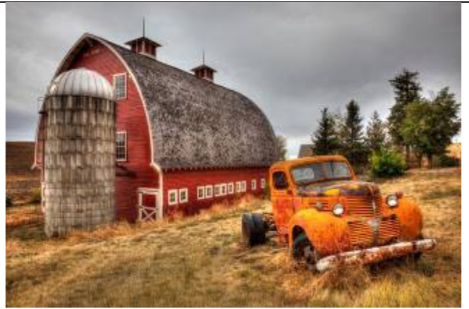
Palouse Farm