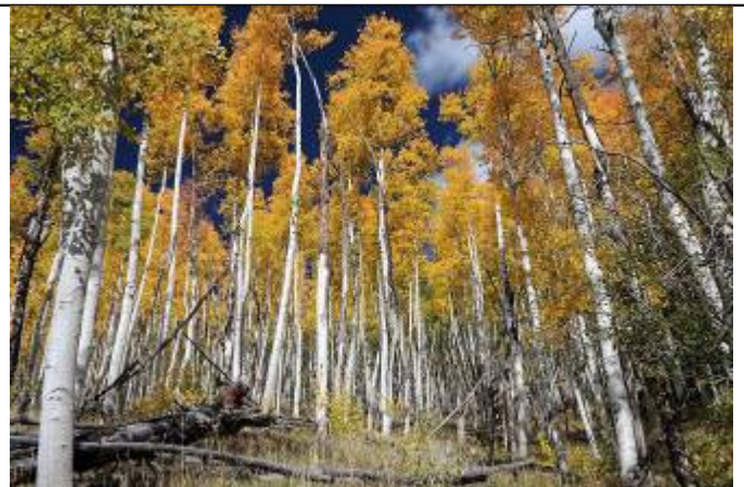
Santa Fay Aspens