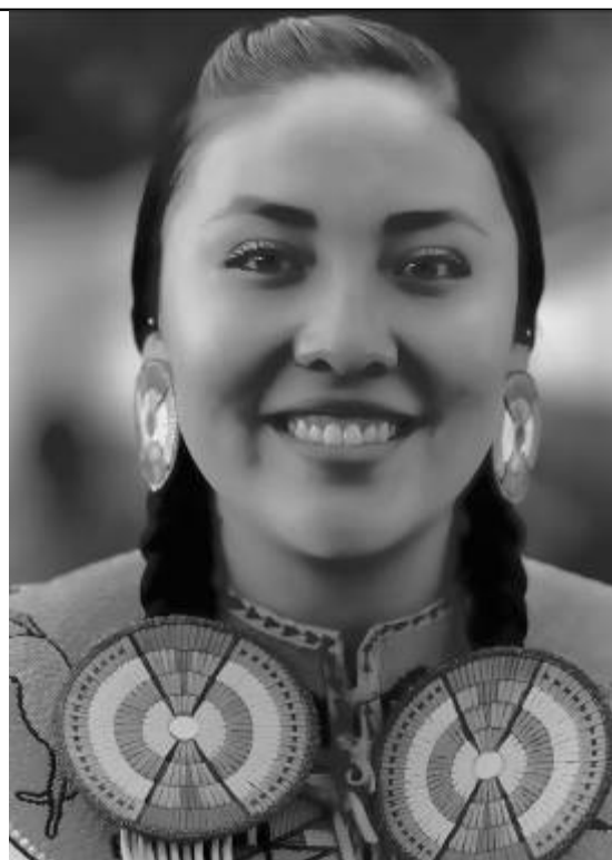
Portrait of a Dancer