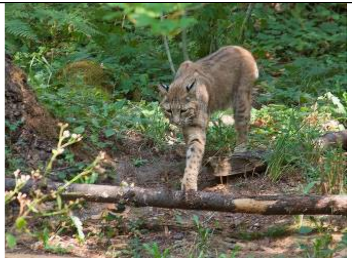
Mr Bobcat