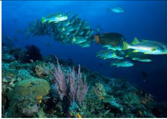
Susies Bommie