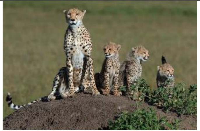
Tommy Lepord By Jack Templeton