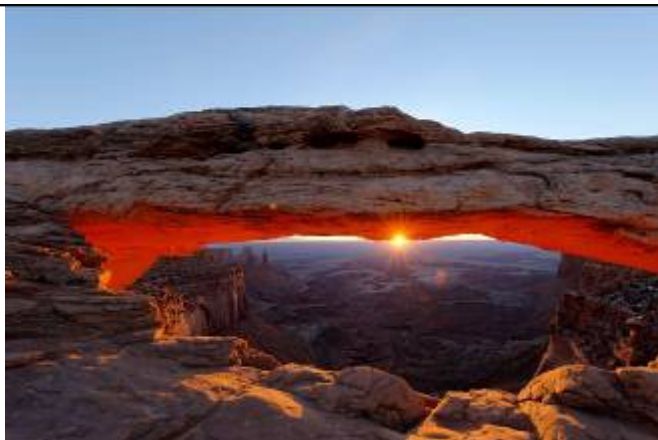
Mesa Arch Sunrise