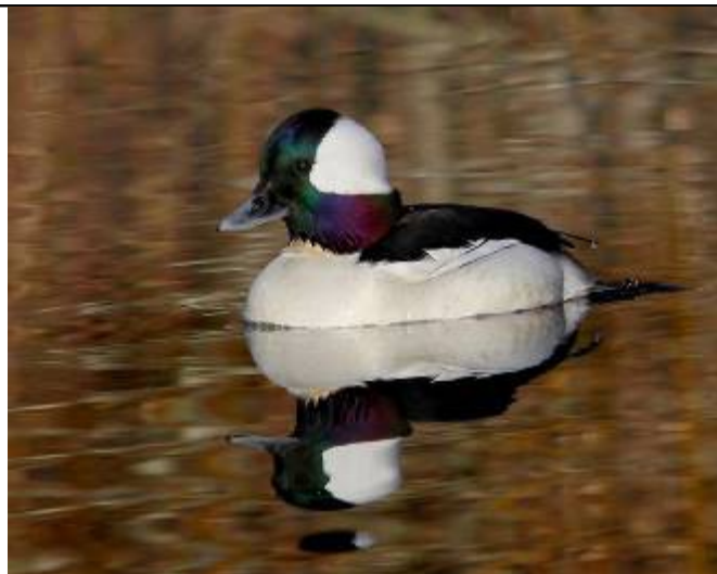
Bufflehead By Emil Heinze