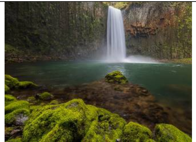
Mossy Abiqua Falls