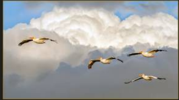
White Pelican Sunset Formation