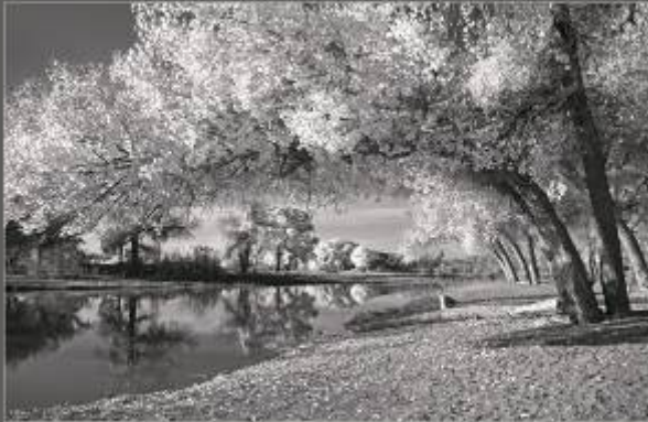
Autumn Inner Mongolia