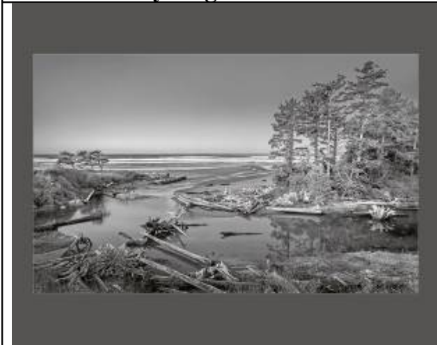
Kalalock Beach