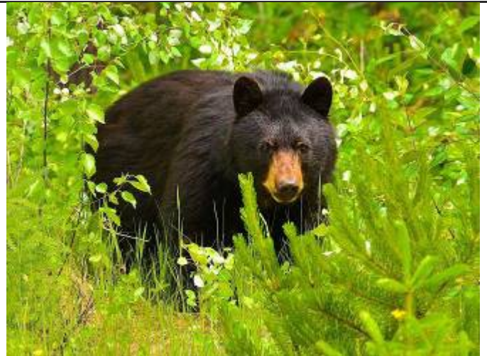
last BC Bear