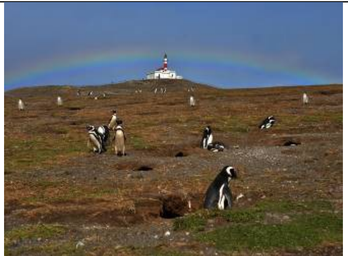
Penguins and a Rainbow on a cloudless By Day Brian Phinney