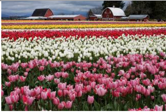
MtVernon Tulip Farm