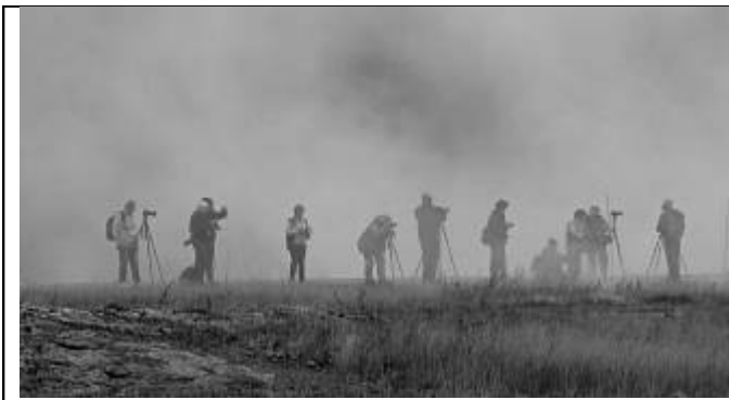
In the Fog