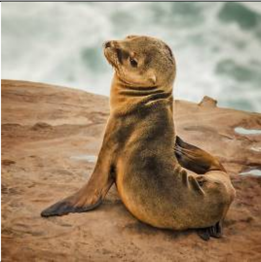
Baby Seal By Lional Harris