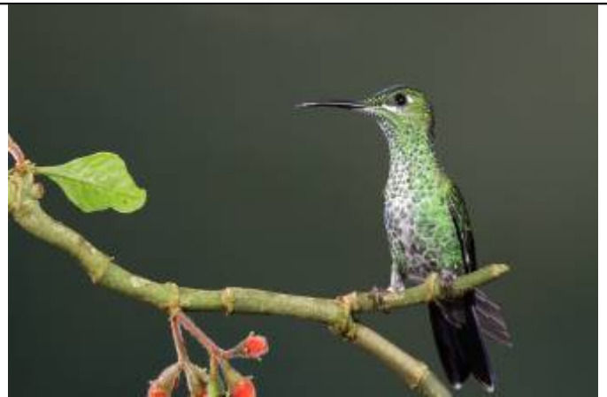
Costa Rica hummers