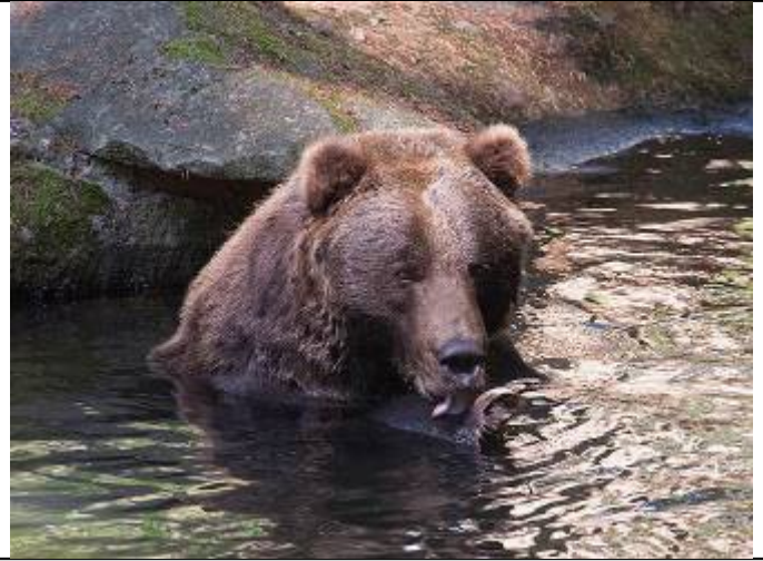
That Was Good