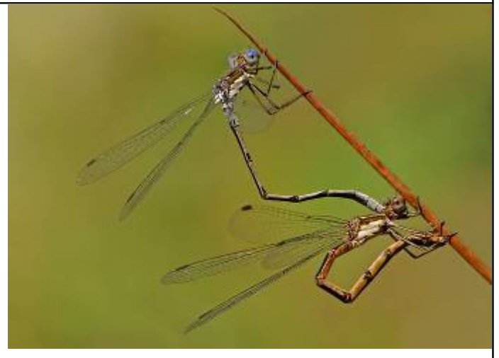
Mating Damselies