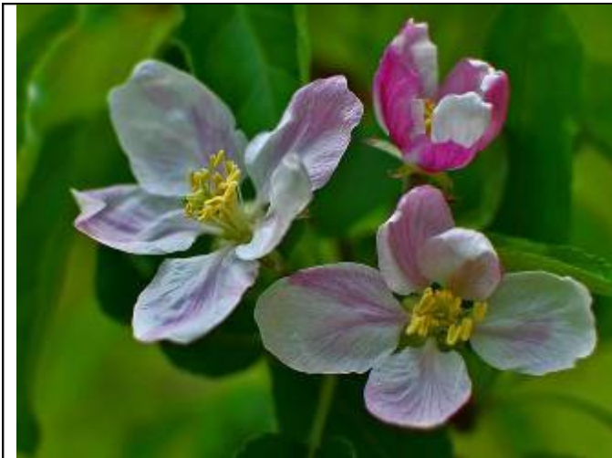
12 Apple Blossoms by Virginia Richter