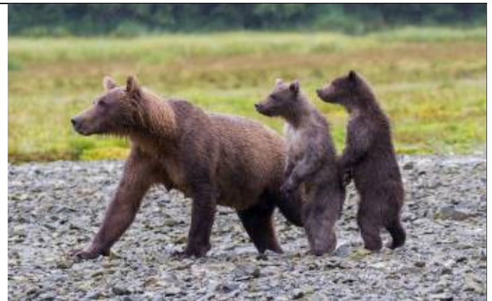
Danger ahead by Jack Templeton