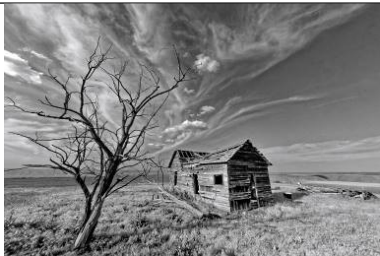
Old House,Eastern WA By Guy Bralley