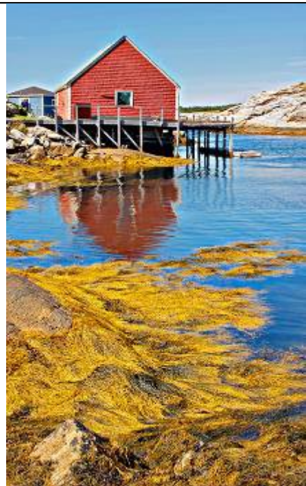
Peggys Cove