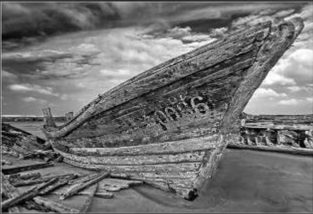
Old Wooden Hull John Davis