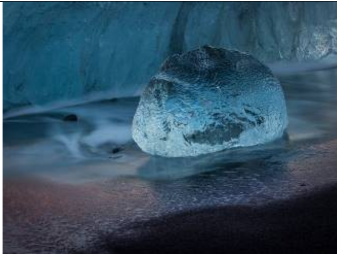
Ice on the Beach By Victoria Braden