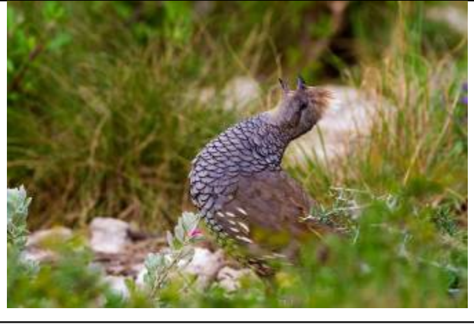
Scale Quail Calling