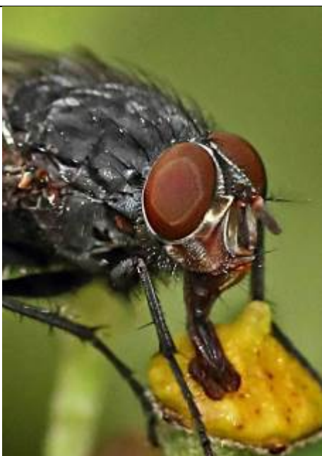
Fly mouth parts By Emil Heinze