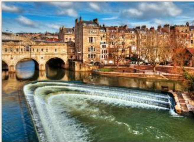
Avon River, Bathwick