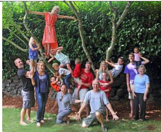
Family Tree By Emil Heinze