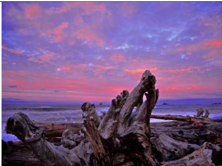
Rialto Beach Sunrise