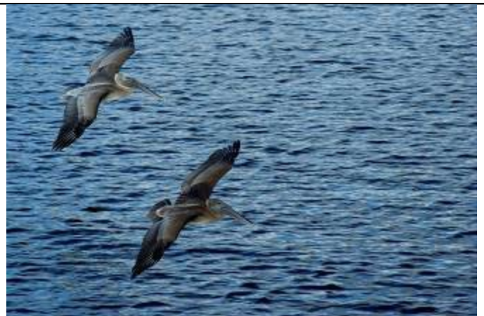
Pelicans on Patrol