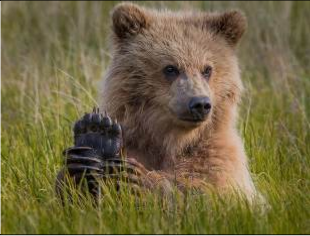
Baby Bear Pedicure