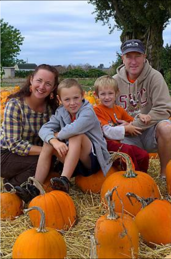
Pumpkin Patch Family By Emil Heinze