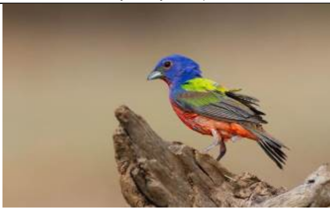
Painted bunting By Jack Templeton