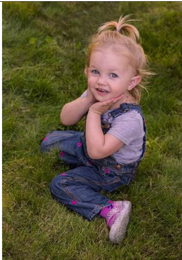
A real cutie