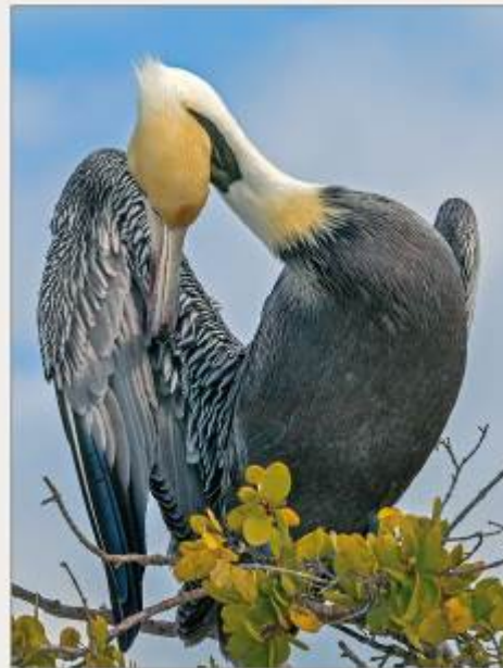
Pelicans Preening