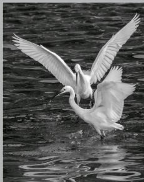
Egrets Interacting