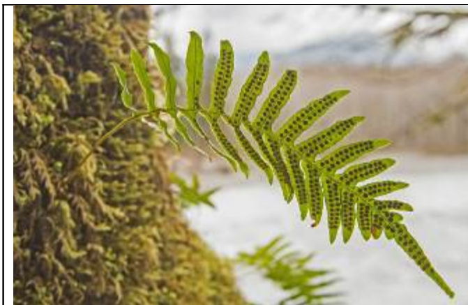
Sword fern