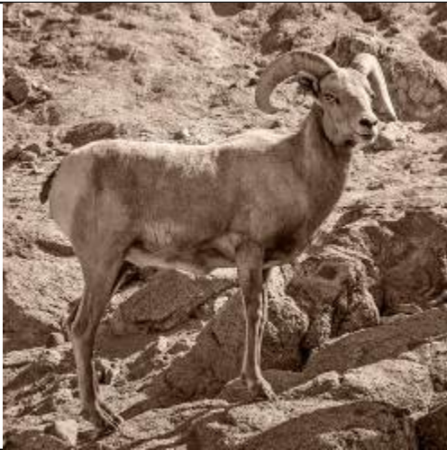
Bighorn Sheep