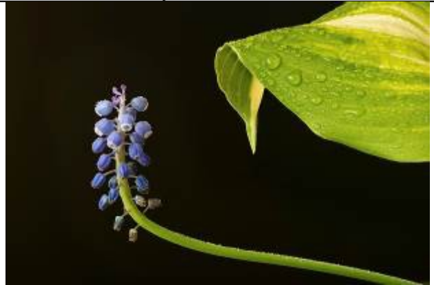
Blue By Tom Layton