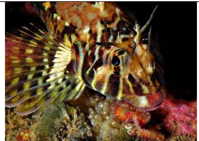
LongfinSculpinGuarding EggsBy S.Fisher