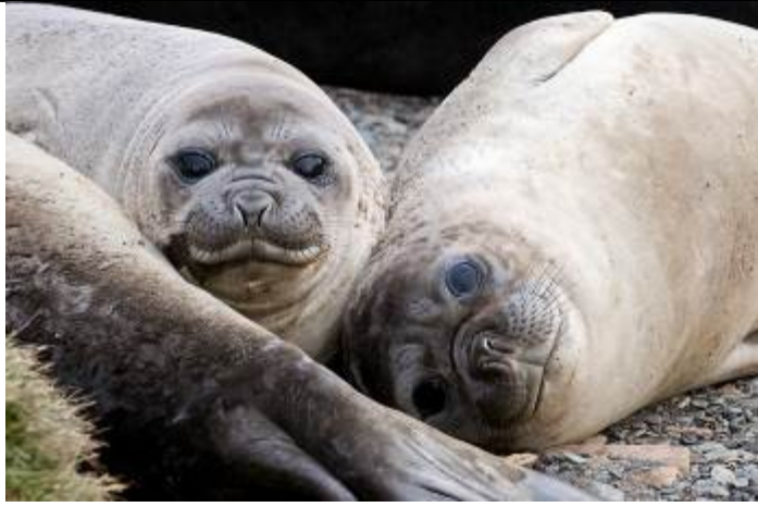
Elephant Seals By Tom Layton