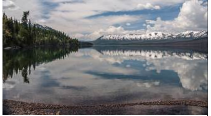
Lake McDonald Glacier Park