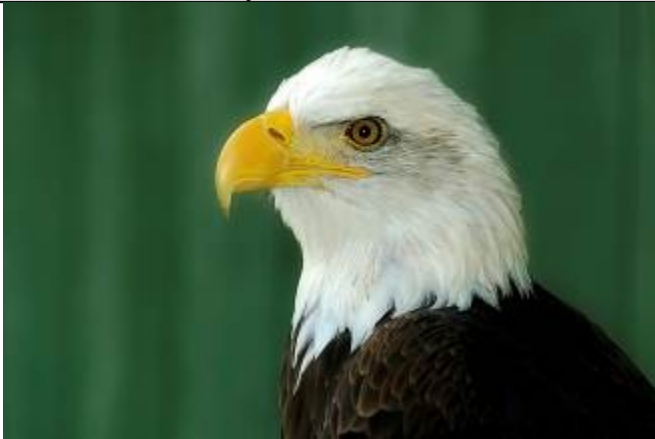
Eagle By Tom Layton