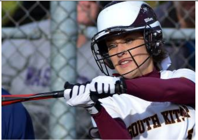
The Swing By Ray Lassila