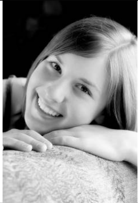
Girl On the Couch By Tom Layton