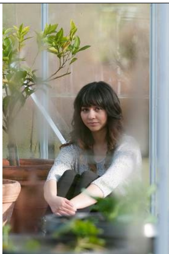
The Greenhouse By Tom Layton