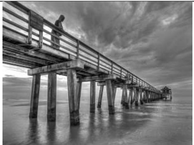
Florida Pier