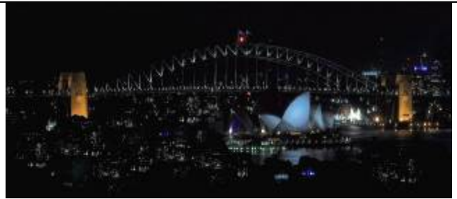
Sydney Bridge and Opera House