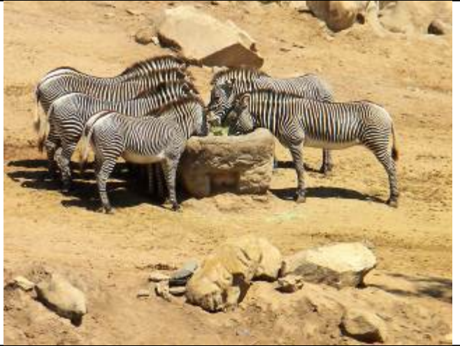
Zebras By Lionel Harris