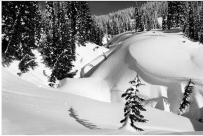
Paradise River in Snow