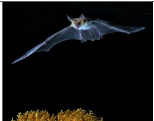
Bat at night By Jack T