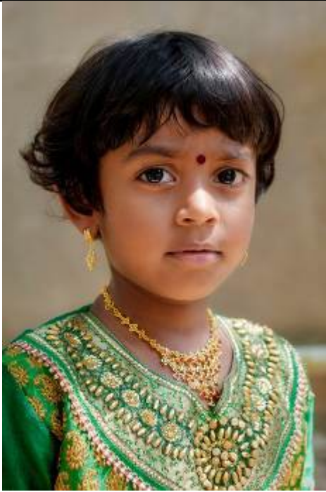
Girl at the Wedding Feast By Tom Layton