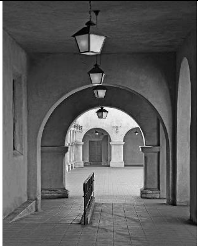
San Diego Park Entry