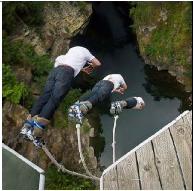
Bungee Jumper By Tom Layton