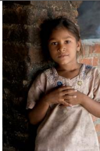
Girl of Bangalore By Tom Layton