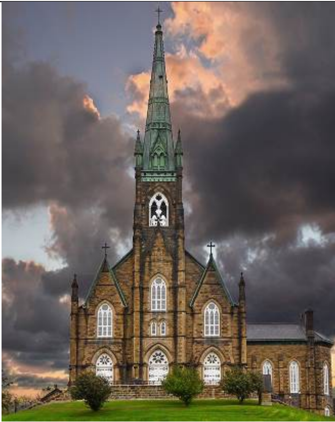
Ornate Church Canada By Lionel Harris