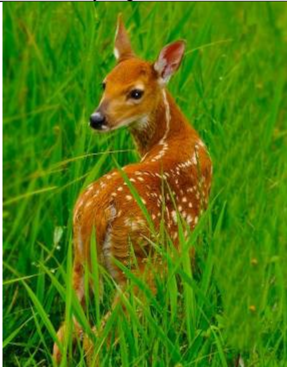
Montana Bambi