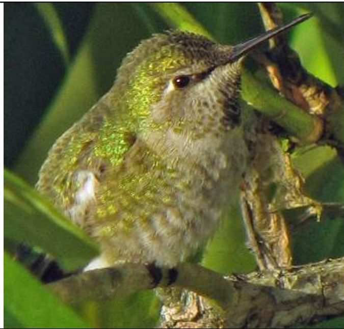
Hummingbird in a Bush By Virginia Richter