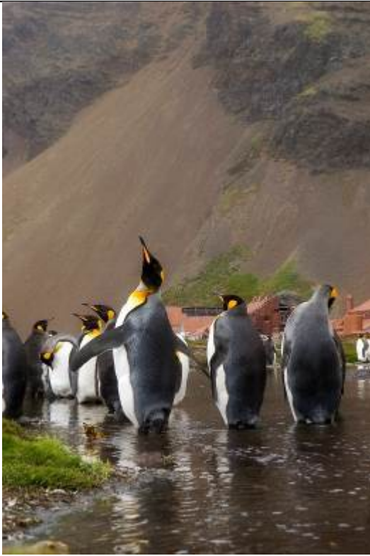
King Penguins By Tom Layton