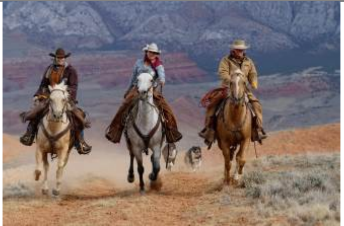
Wait For Us By Jack Templeton