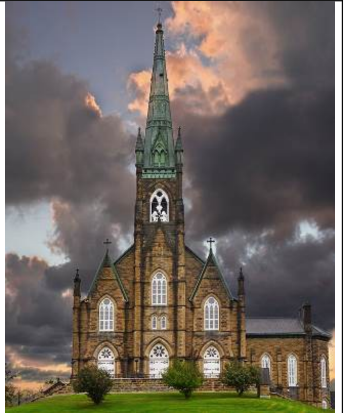
Old Ormate Church-Canada By Lionel Harris