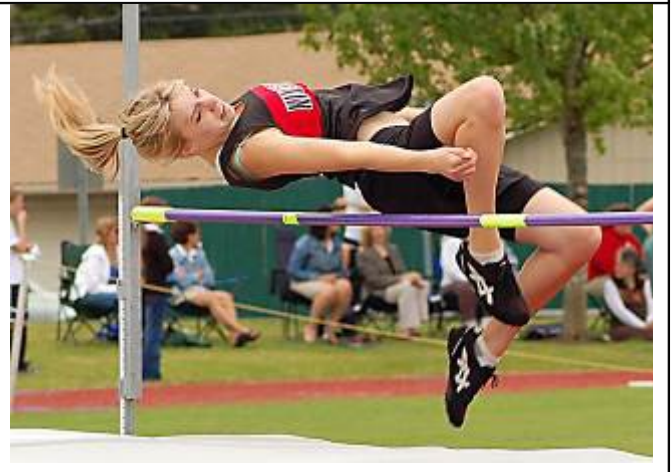
Clearing the Bar By Emil.Heinze