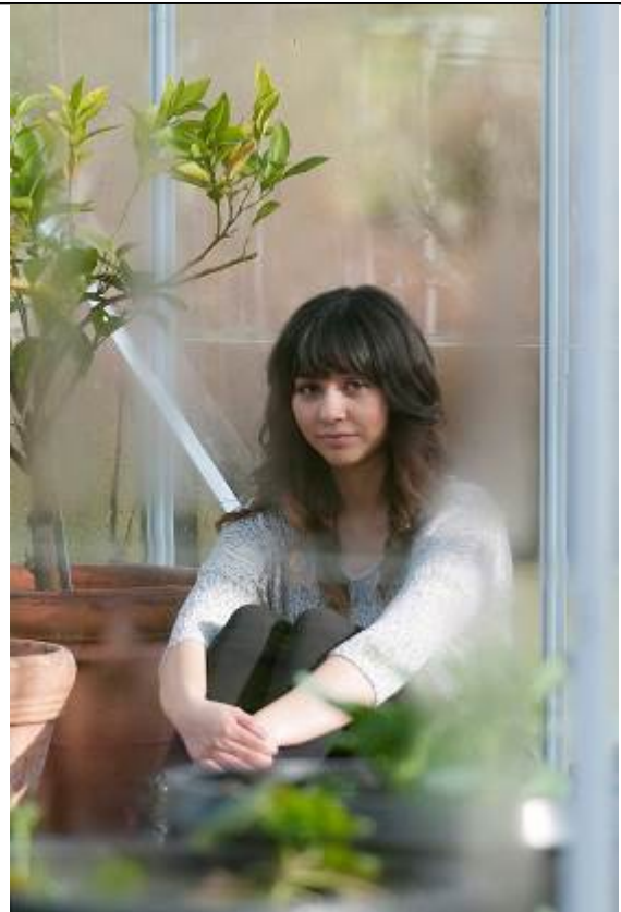
The Greenhouse By Tom Layton