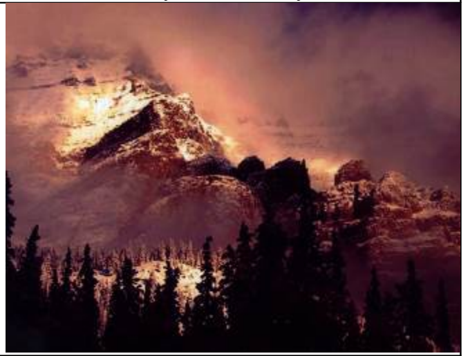
Jasper Peaks