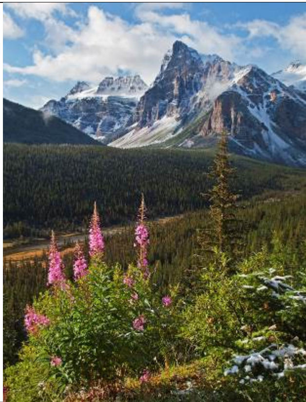
August Fireweed and Snow