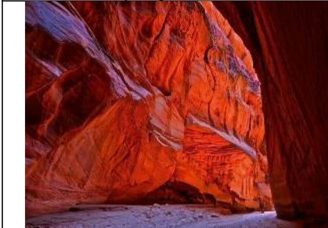
Buckskin Gulch