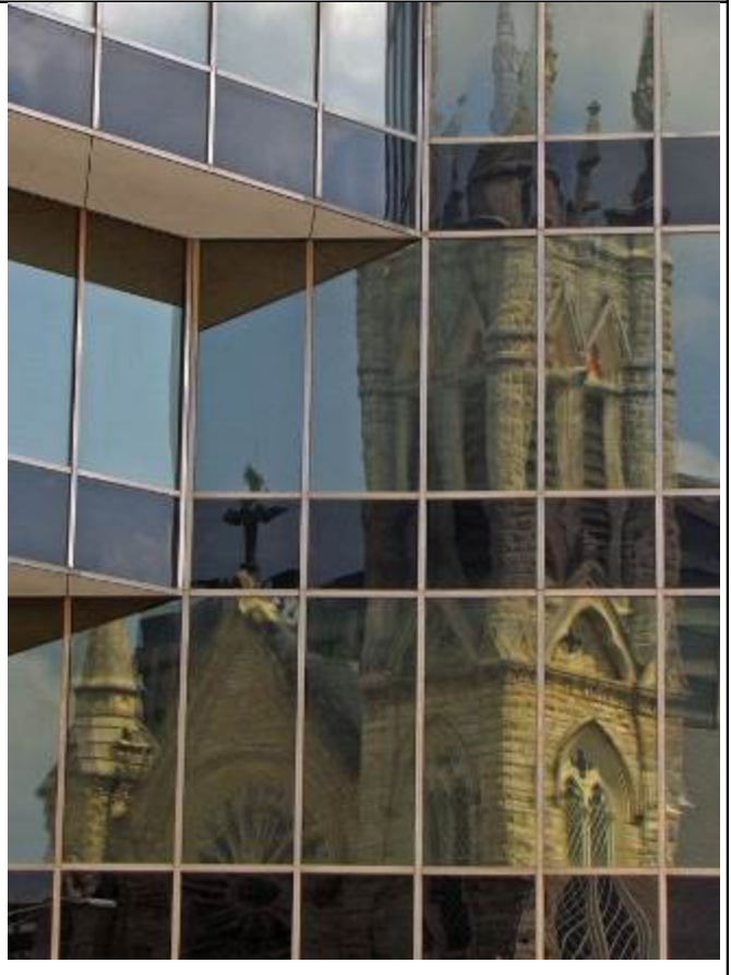
Cathedral Reflection - Austin TX By Virginia Richter