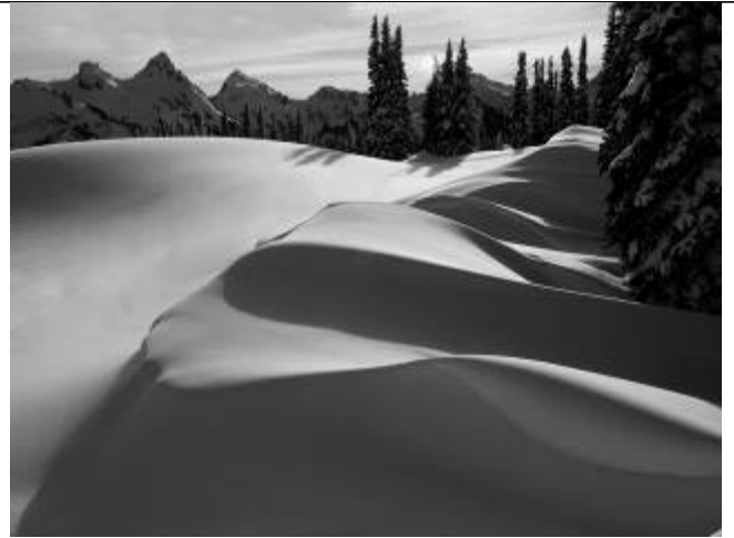
Snow Drifts