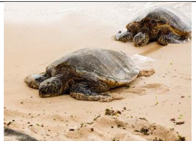
Time for some sun