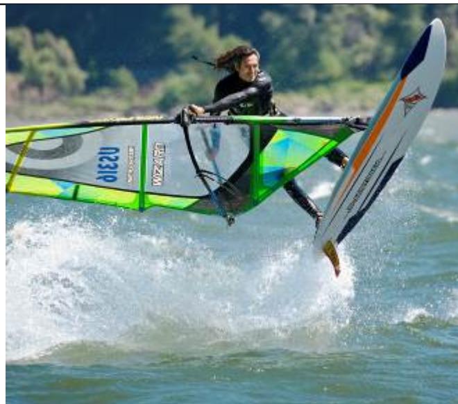
NICE BREEZE By Ray Lassila