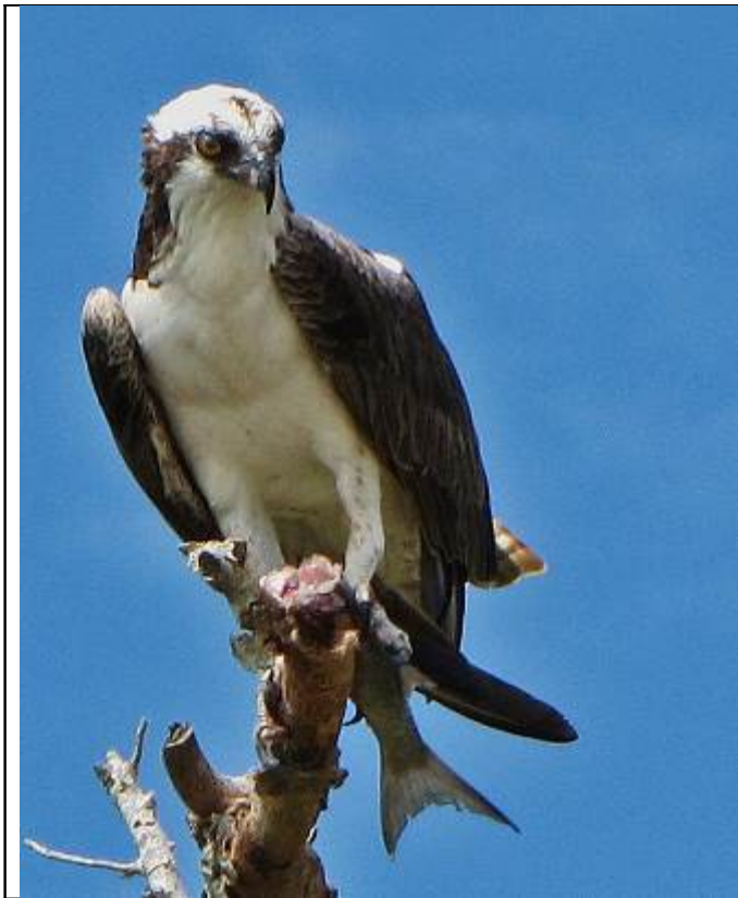
Osprey on a Lunch Break