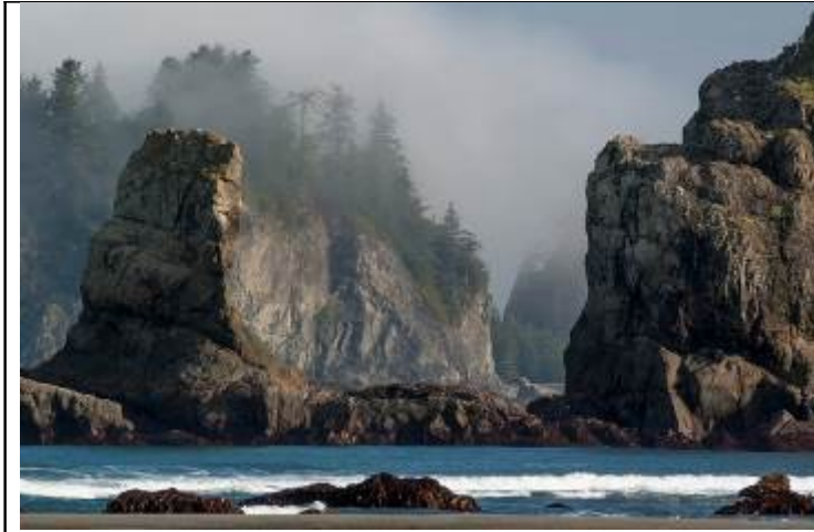
Washington Coast