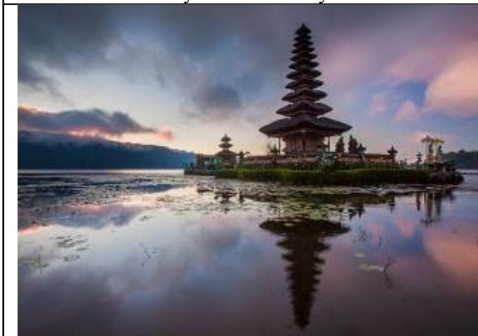
Temple on Lake Bratan By Victoria Braden