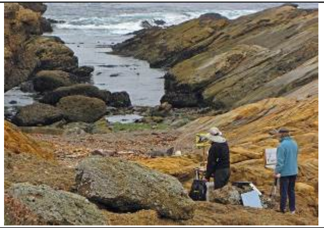
Painters at Point Lobos By Virginia Richter