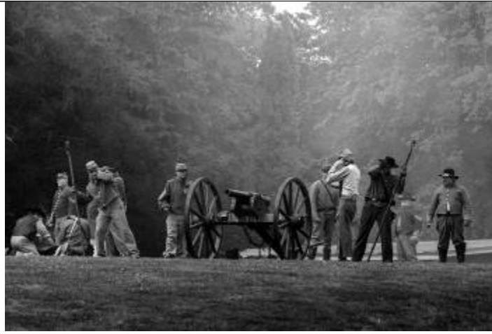
Ready to Fire