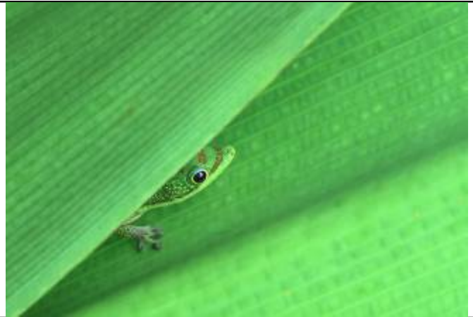
Gecko