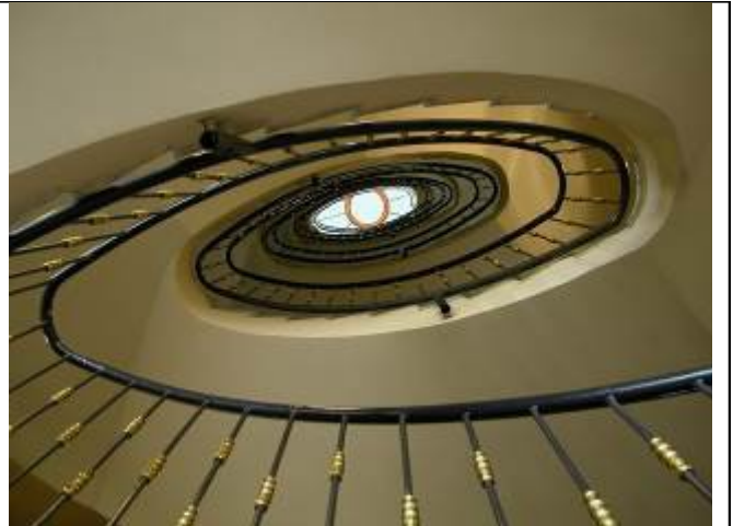
Millennium Hotel Sunroof