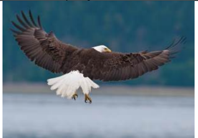
Hovering