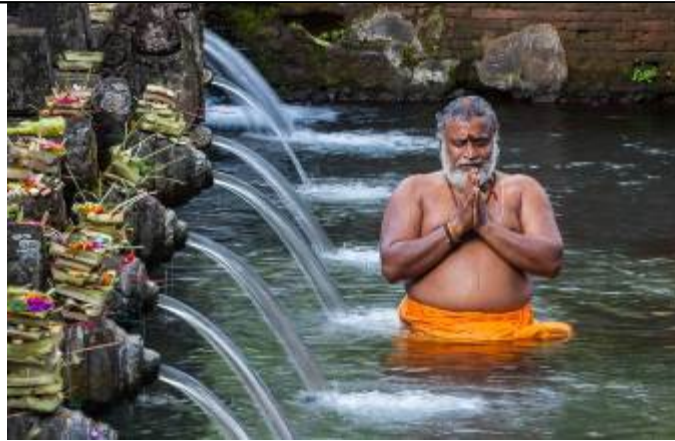
Devout Hindu Praying