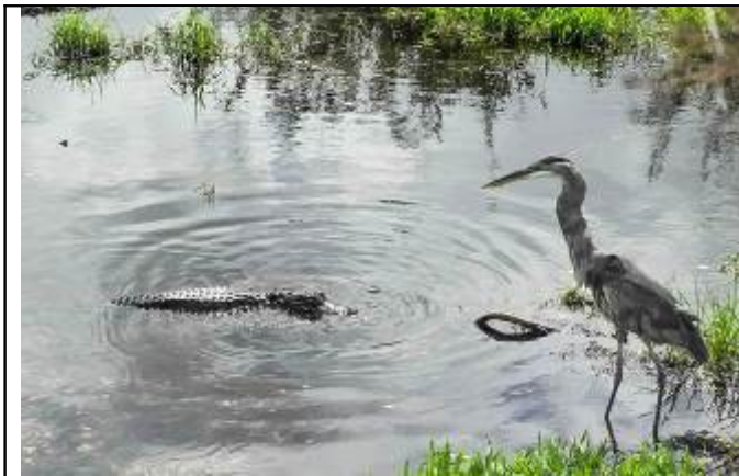
Lunch