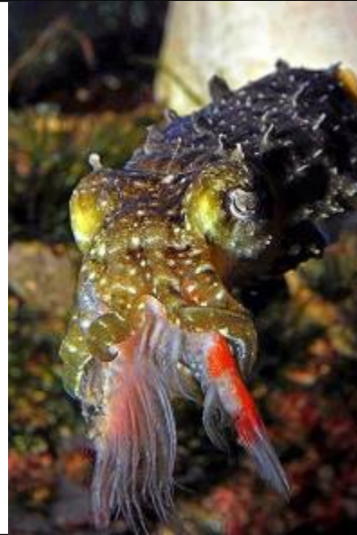
Dwarf Cuttle With Shrimp By Steven Fisher