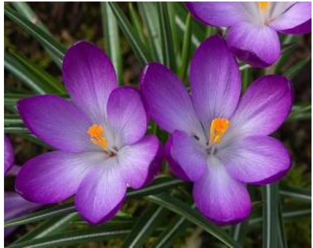
Crocus and Insect By Emil Heinze