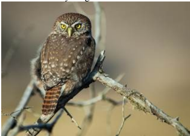
Austral Pygmy Owl on Limb By Victoria Braden