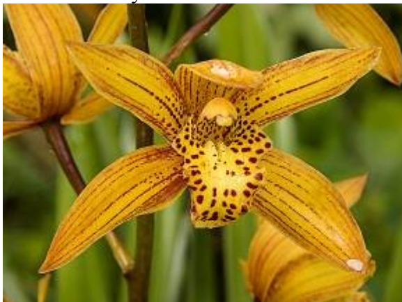
Orchid for my lady