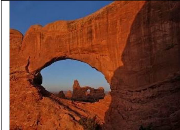
Through the North Window By Brian Phinney