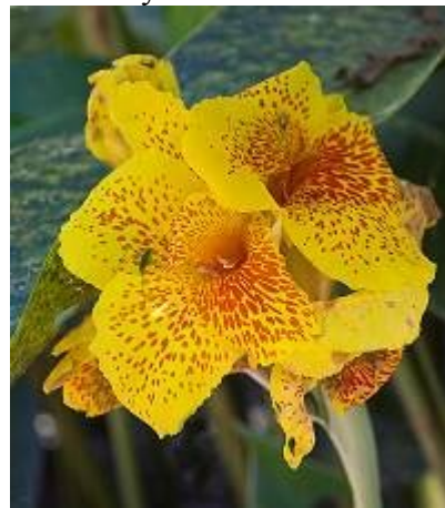
Bug on Flower