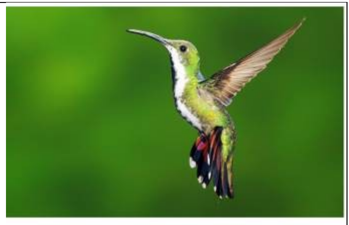
Female Green Breasted Mango By Jack Templeton