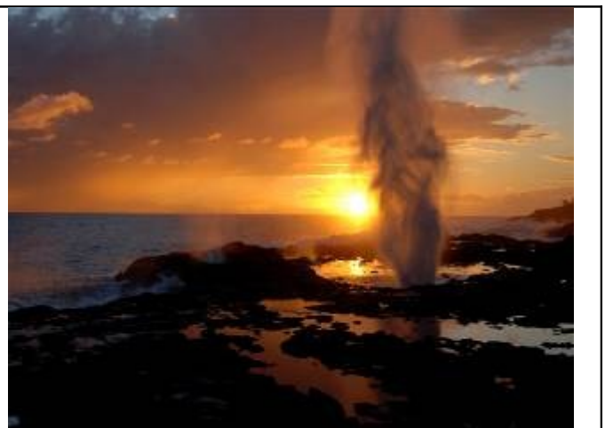
Spouting Horn Sunset