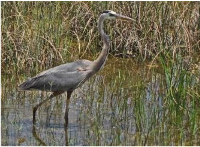
Great Blue Heron – Everglades By Virginia Richter