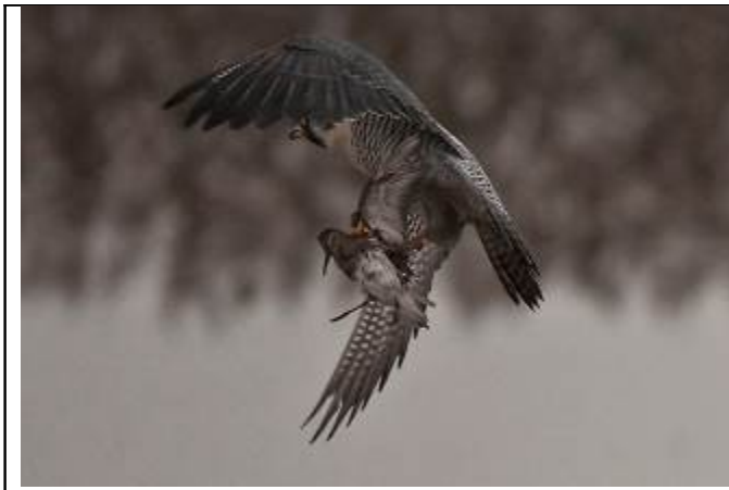
Falcon With Dunlin