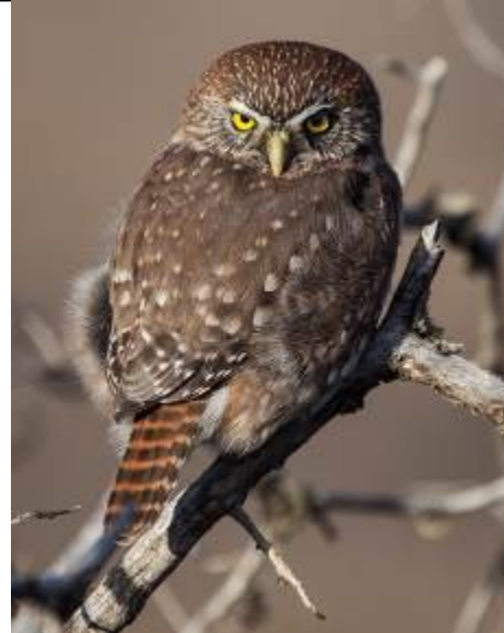
Pygmy Owl By Victoria Braden