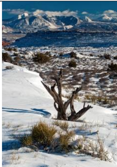
La Sal Mtns