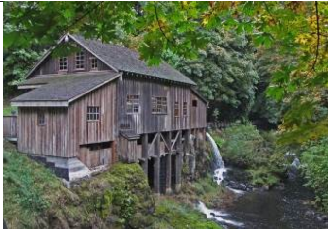
Cedar Creek Gristmill