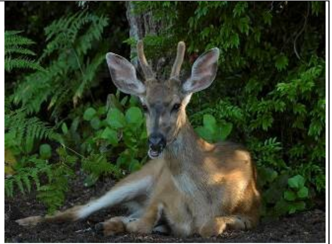
Young Buck