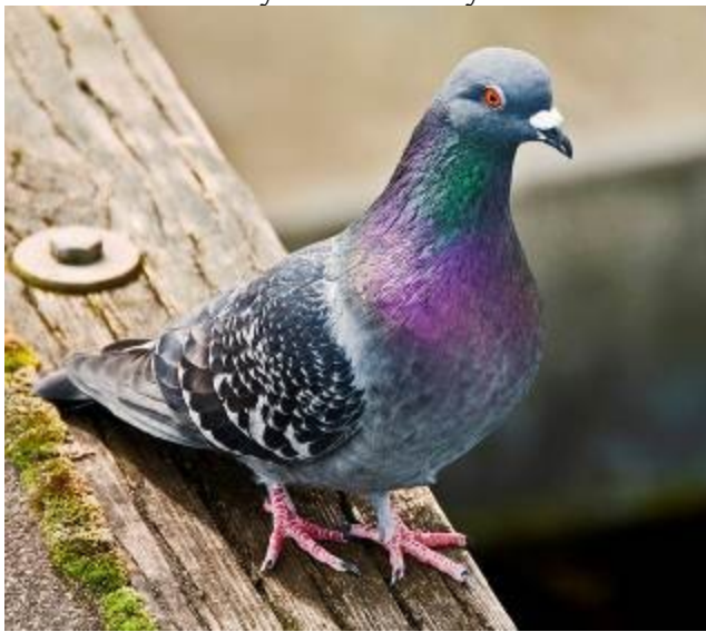
Colorful Pigeon By Lionel Harris