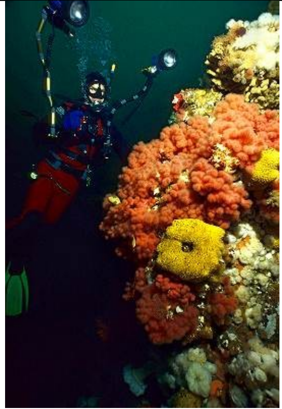
UW Photog Canada