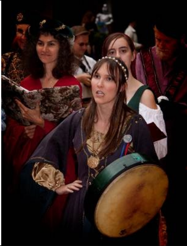
Now Listen to Me