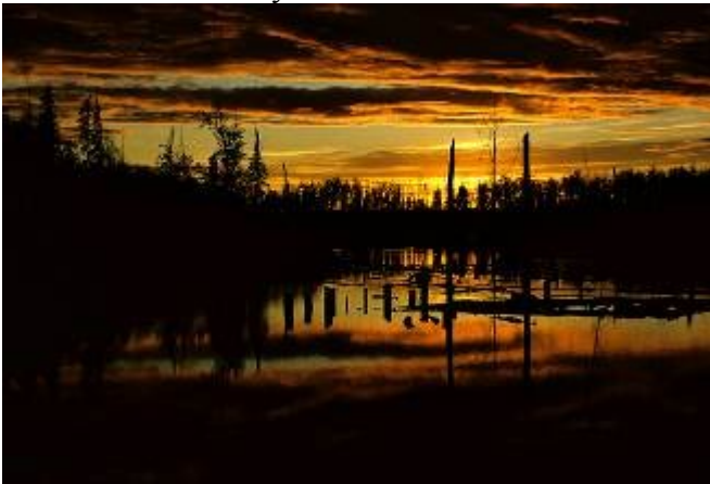
Palmer, AK Sunset