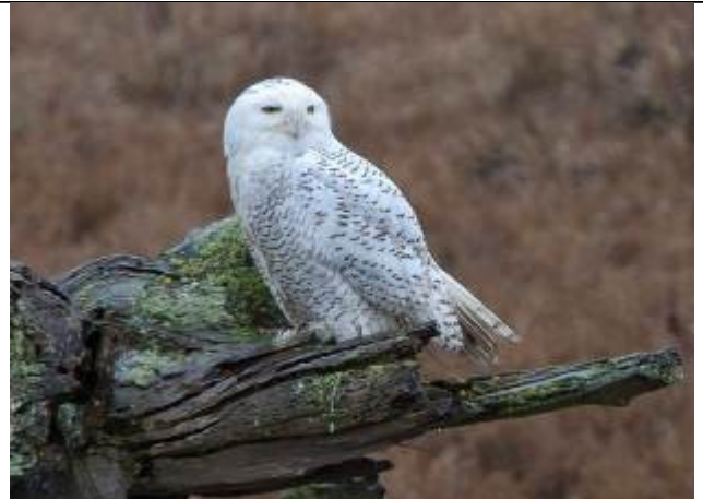
snowy owl boundary bay