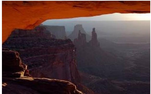
Mesa Arch Sunrise