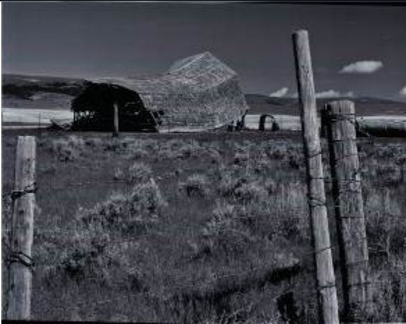
Old Timer