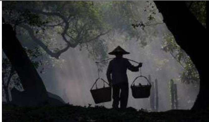
Silhouette Of Woman