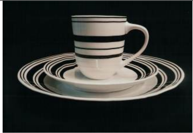
Cup,Sauce,&Plate By Pam Bell