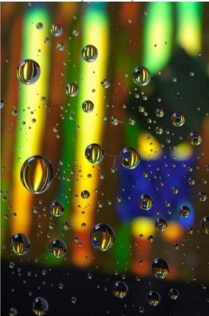
Droplets