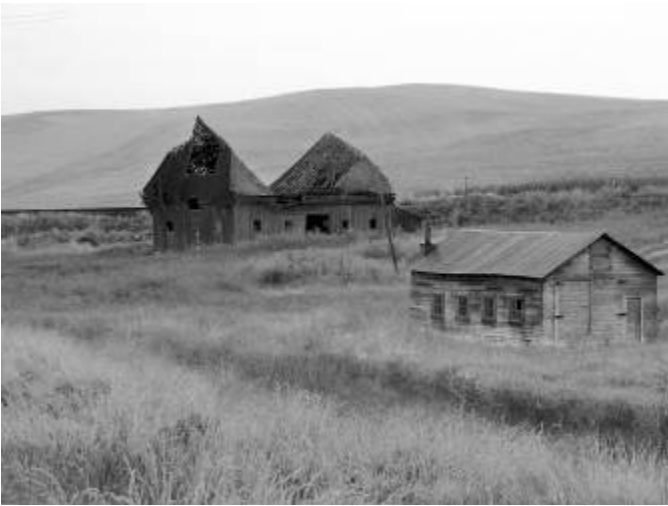
Swayback Barn