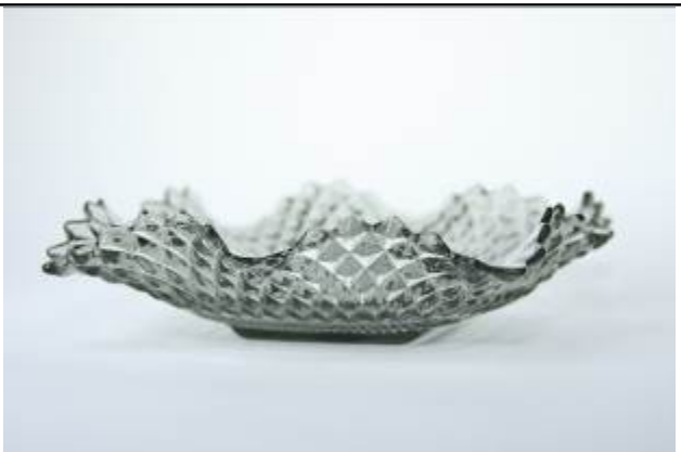
Depression Glass By Joe Krueger