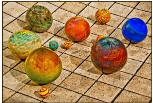
Glass Balls Display By Lionel Harris