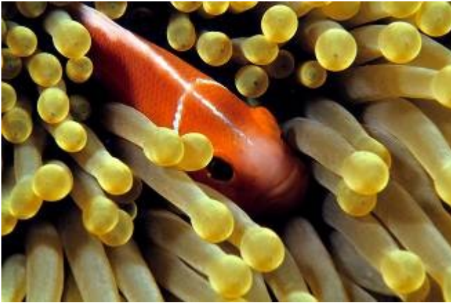
Anemone fish tucked-in By Steve Fisher