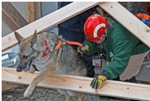
Search and rescue