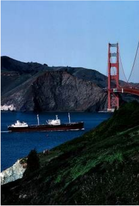
Baker Beach