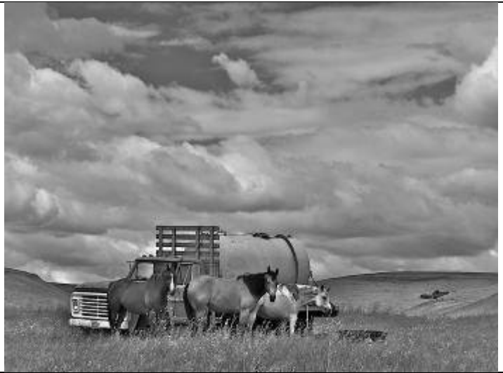
Got Water?