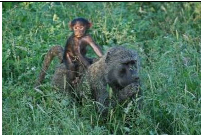
along for the ride