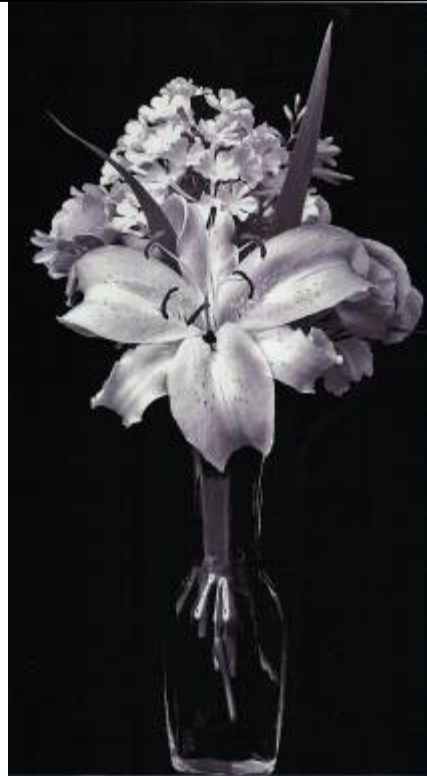
Flowers in Vase By Lionel Harris