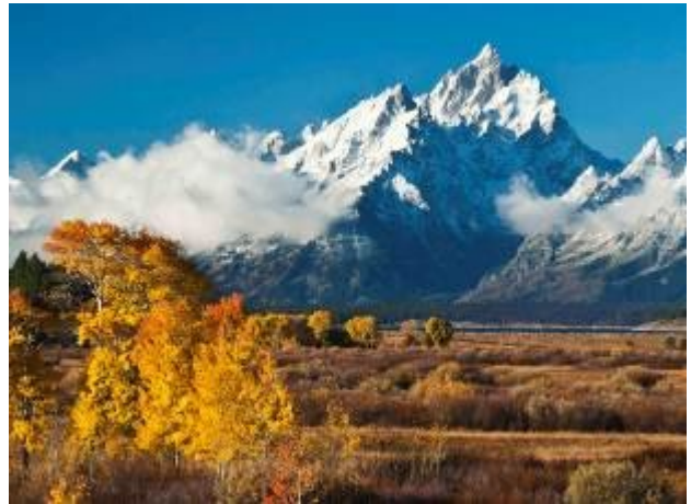
Grand October By Ray Lassila