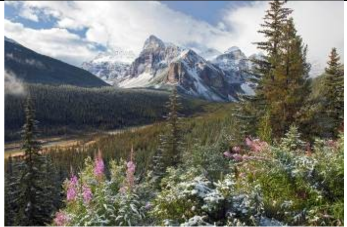
Valley of 10 Peaks