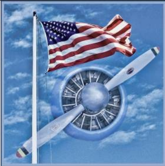
WW II Air Power By Lionel Harris