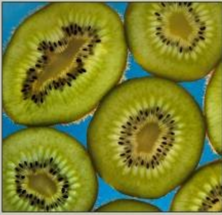
Kiwi Tiangles