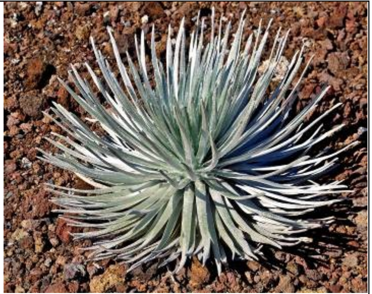
Silver Sword at 10,033 ft. Lionel Harris