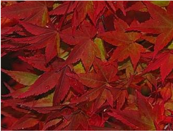
Fall Color 3 2011 By Jim Haney