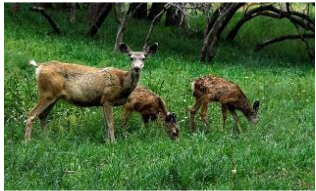
Doe & twin fawns – Philmont