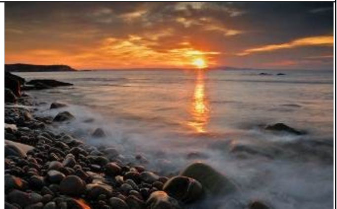
Sunset at Barinoche