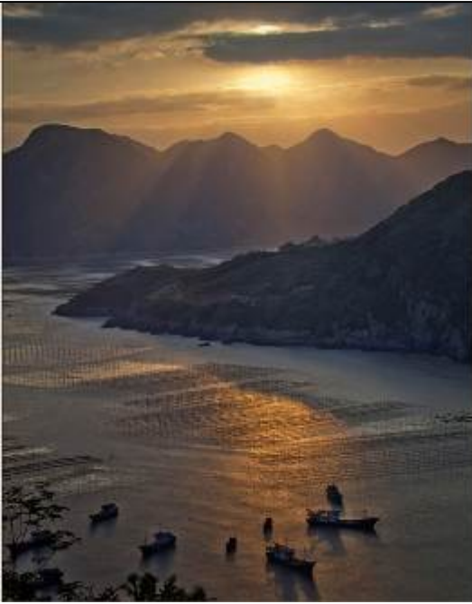
Sunset Lights Bay