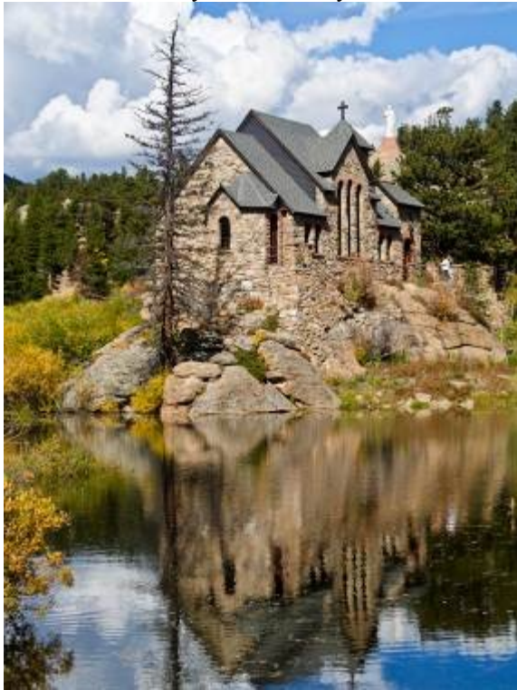
Colorado Church By Lionel Harris