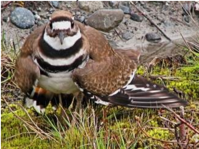
Killdeer 4-1-11