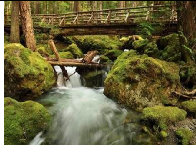
Lena Creek Cascades