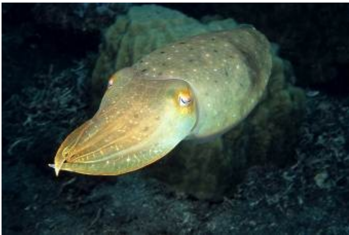
Cuttle - Ready to Propel By Steve Fisher