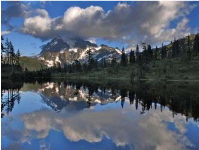
Reflections