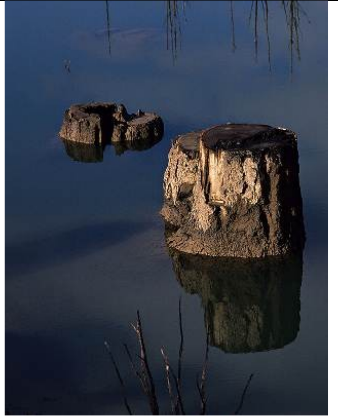
Stump Reflections By Steve Fisher