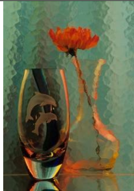
Flower Behind Glass By Jack Templeton