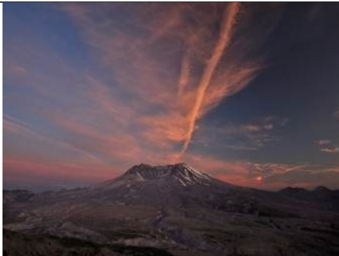
St. Helens' Sunset