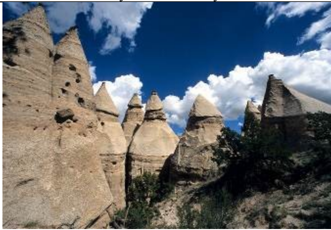
Tent Rocks Sky