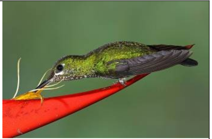
Hummer Drinking By Jack Templeton