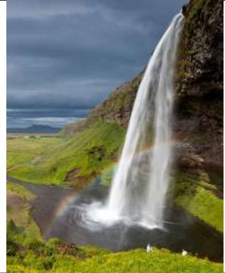
Rainbow in Sejalandsfoss By Victoria Braden