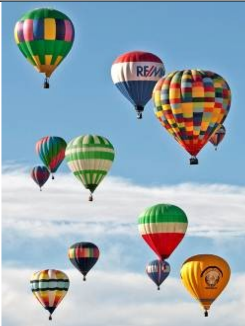
Up Up and Away By Lionel Harris