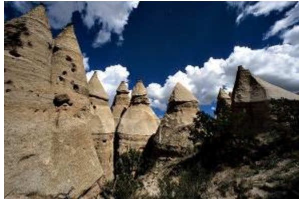
Tent Rocks & Sky