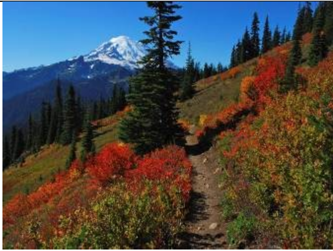
Fall Colors Naches Loop