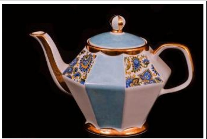
Teapot By Lionel Harris