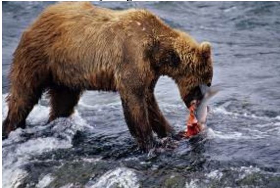
Skinned Alive By