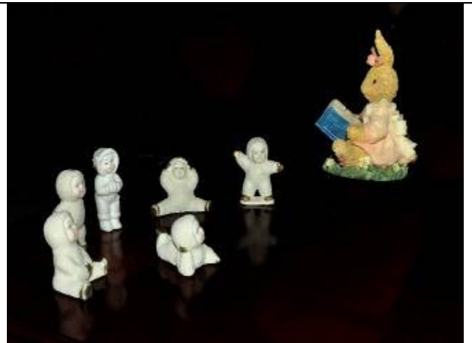
Listen up