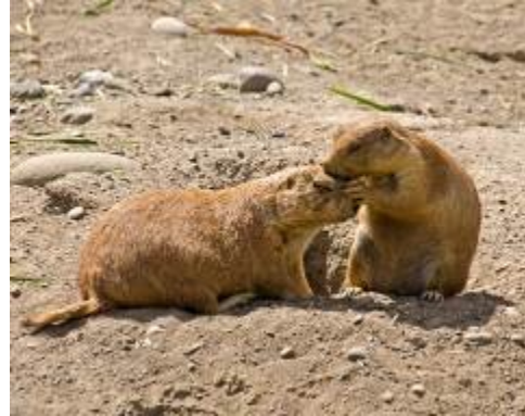
Good Morning Sweetheart, Lionel Harris