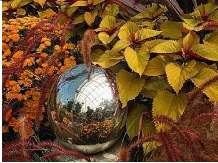
Volunteer Park Conservatory