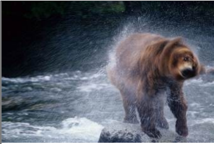
Spin Cycle By Jack Templeton