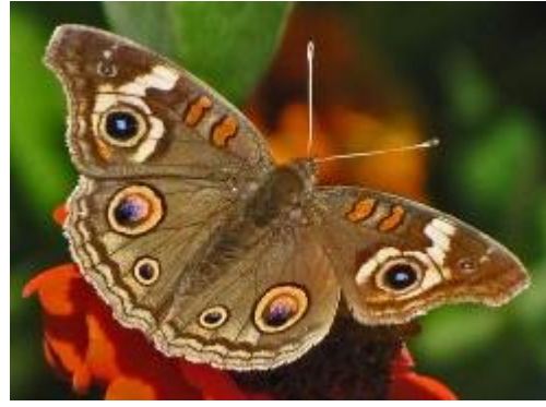
Buckeye Butterfly by Virginia Richter