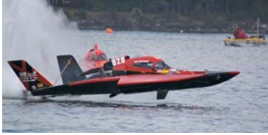
Silverdale Thunder , by Erich Weaver