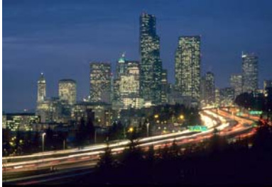
Twilight Seattle Skyline , by Steve Fisher