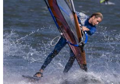
US-22