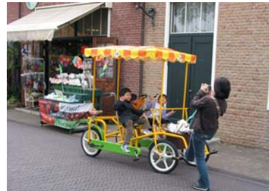
Family Picture