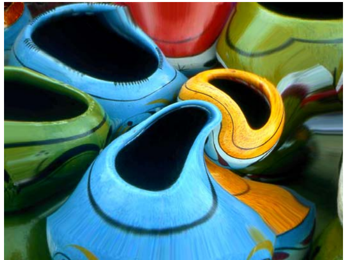
Makah Crafts on a Hot Day – Class A Color Prints, Creative Category – Sept