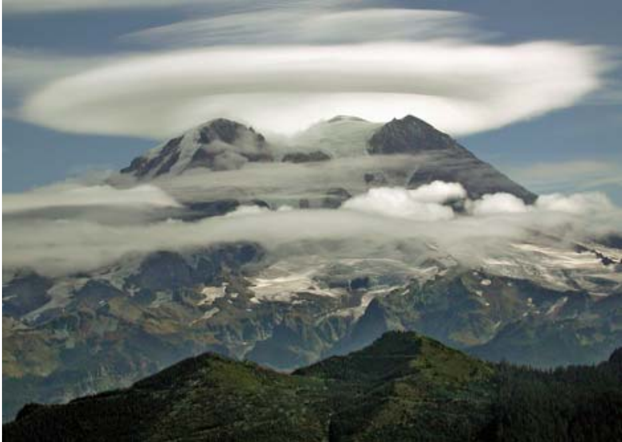
Mt. Rainier Lenticular, 1 st Place Tie, Digital Class A General – September