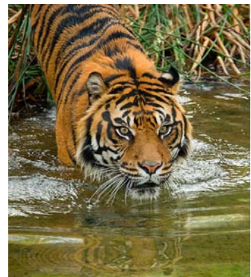
Book – Sumatran Tiger – digital A General, Sept.